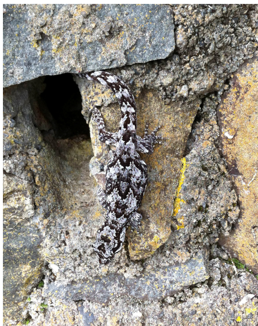
NZ Forest gecko at Otari on a rock wall below the lookout