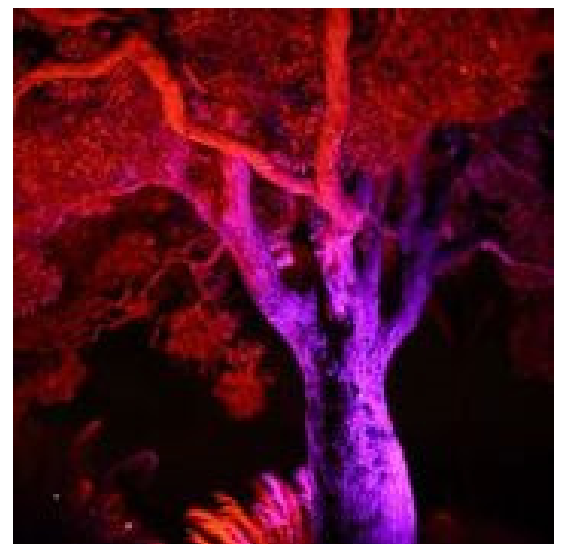
Ngaio tree at the end of the Cockayne Lawn