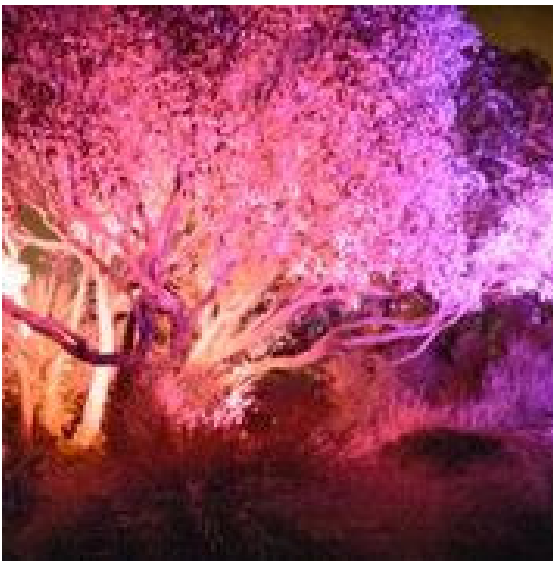
Olearia albida in the Canterbury Border