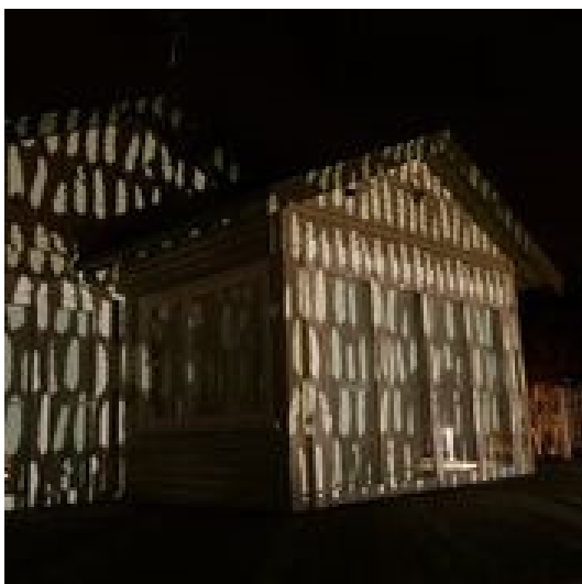
The Cockayne Centre