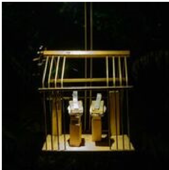
Bird call devices in the Fernery.