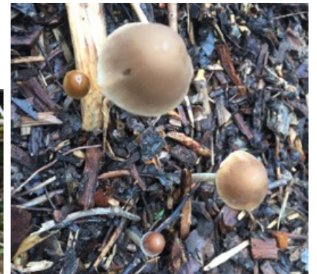
Above: Psathyrella sp