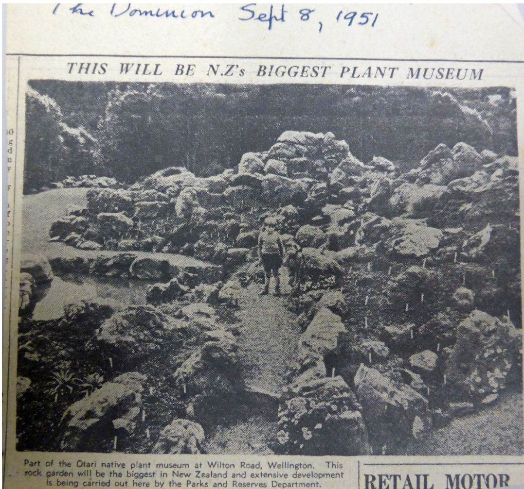
The Dominion September 8, 1951.

“Part of the Otari native plant museum at Wilton Road, Wellington. The rock garden will be the biggest in New Zealand and extensive development is being carried out here by the Parks and Reserves Department.”